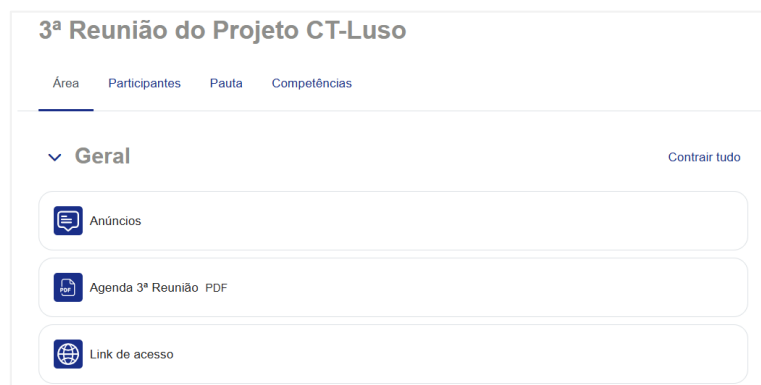
Figure 4 - Meetings contents: agenda, links, other documents

CT-Luso will use this platform to upload project meeting materials (Figure 4) and for training courses scheduled for Work Packages 4 (Figure 5), 5, 6, and 7.