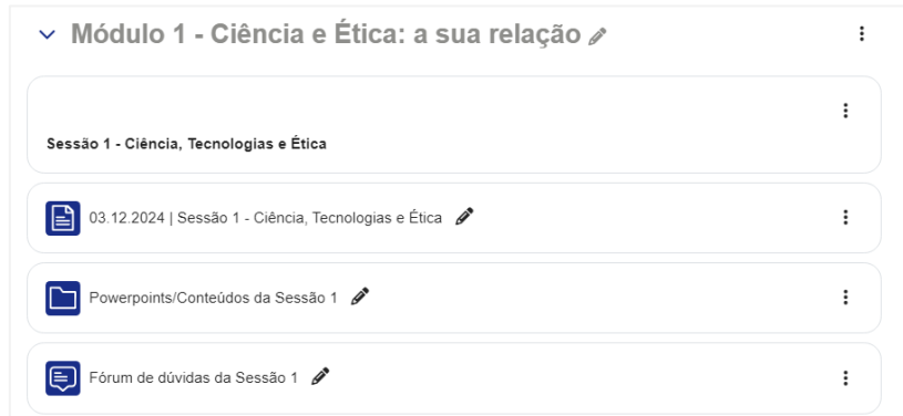
Figure 5 - Work Package 4 Training Program contents

The platform enables the creation of several resources and activities, providing trainees with access to a wide range of learning options, including study materials, sessions recordings, tests, assignments, and forums. Additionally, it supports the creation of polls, surveys, and databases. Content can be developed in advance, allowing trainers to prepare materials ahead of time and keep them hidden from users until they are officially released.