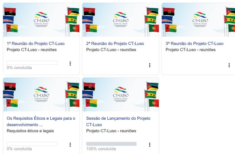
Figure 3 - Courses overview